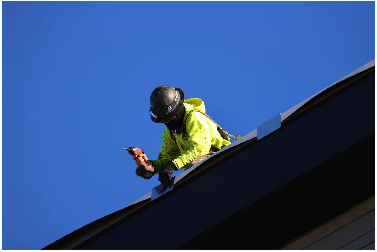
Workers injured on the job in construction and other high-risk industries are entitled to workers' compensation benefits, but some employers discourage them from applying.