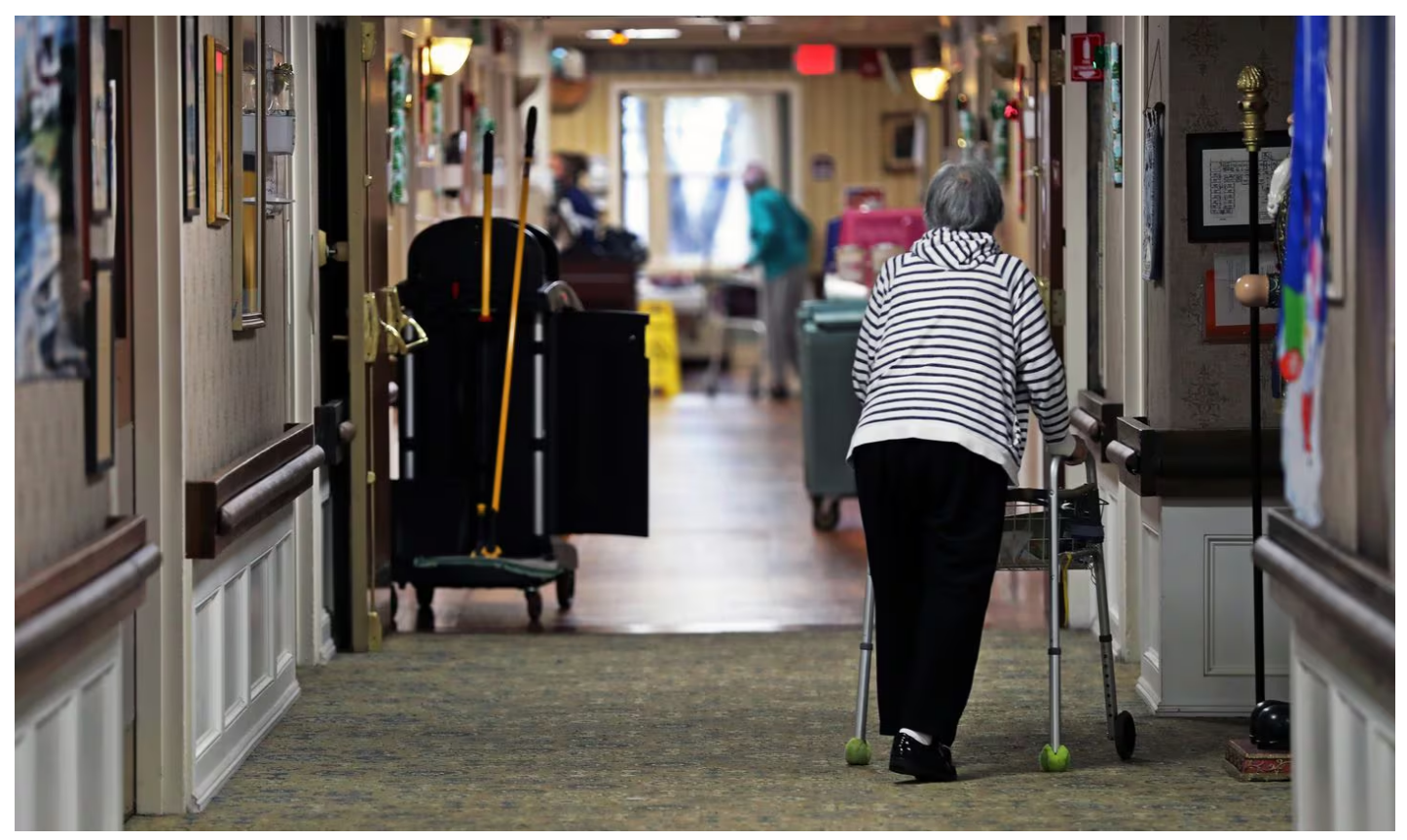
A hallway at Blaire House nursing home in Tewksbury.